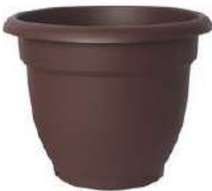
10" Ariana Pot Chocolate