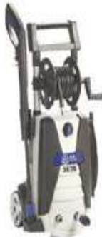
1,800 PSI Electric Pressure Washer Sku #770469