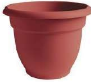
10" Ariana Pot Brick