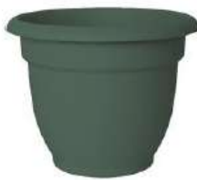
10" Ariana Pot Thyme Green