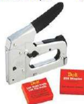
Staple Gun Kit Sku #319988