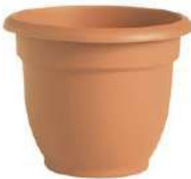
10" Ariana Pot Clay