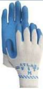
Palm Dipped Glove - Large