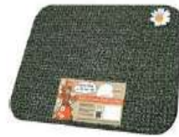
18" x 24" Daisy Mat Evergreen Sku #638218