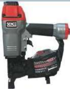
455XP Coil Roofing Nailer Sku #356166