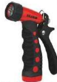
Pistol Nozzle Red