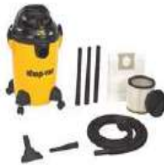
6-Gal. Wet/Dry Vac Sku #369373