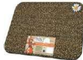
18" x 24" Daisy Mat Wheatfield Sku #629225