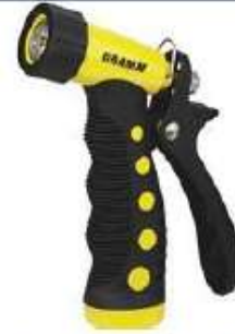
Pistol Nozzle Yellow