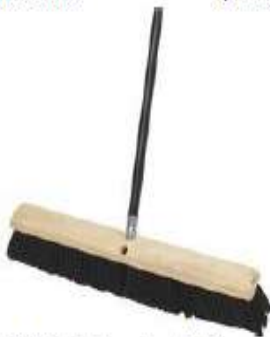
24" PolyPro Push Broom Sku #639648