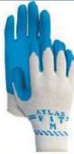
Palm Dipped Glove - XLarge