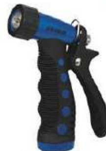
Pistol Nozzle Blue