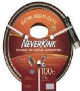
5/8" x 100' NeverKink Hose Sku #705998