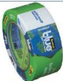
2" Blue EdgeLock Tape