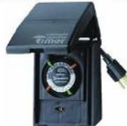
15A Outdoor Plug-In Timer