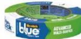
1" Blue EdgeLock Tape Sku #786478

M&S VALUE PRICE $0.99 Amazon.com $1.97 - $2.07 The Home Depot $1.29