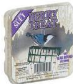
11-oz. Treat Suet (Nutty or Berry) Sku #730679/730693

M&S VALUE PRICE: 20 Foot $139.00 24 Foot $159.00