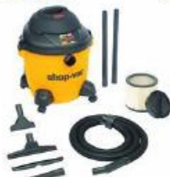
10-Gal. Wet/Dry Vac