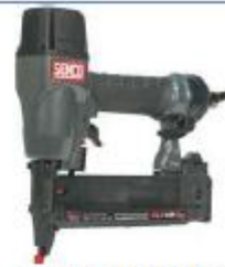
1/4" Crown Stapler Sku #394920

M&S VALUE PRICE $19.98 Lowe's $23.98 Amazon.com $23.91