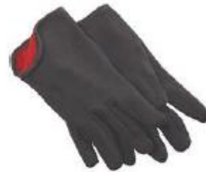
Large Jersey Lined Glove Sku #708416

M&S VALUE PRICE $12.98 Amazon.com $18.99 Ace $16.99 Lowe's $14.97