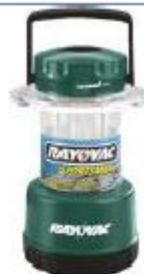
Krypton 4D Area Lantern