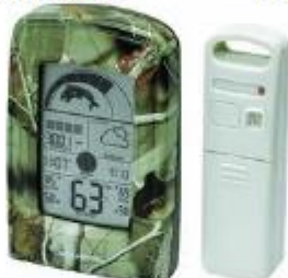
Sportsman Forecaster Weather Station