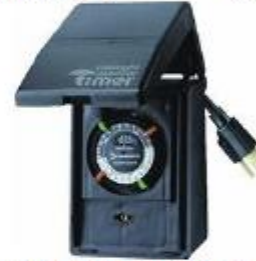
15A Outdoor Plug-In Timer