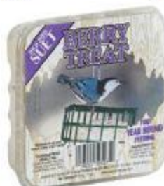
11-oz. Treat Suet (Nutty or Berry)