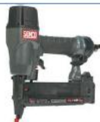
1/4" Crown Stapler