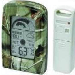
Sportsman Forecaster Weather Station Sku #850189

Amazon.com $95.42 TrueValue $84.99 Lowe's $69.98