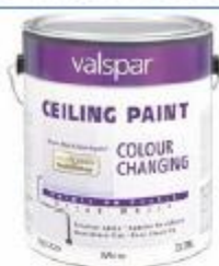
Colour Changing Ceiling Paint