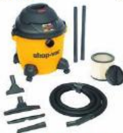
10-Gal. Wet/Dry Vac

The Home Depot $23.49 Ace $21.99 Amazon.com $16.78