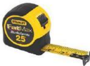
25' FatMax Tape Measure