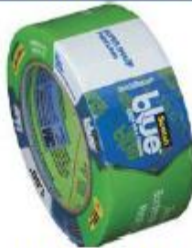
2" Blue EdgeLock Tape

Ace $9.99 The Home Depot $7.67 Amazon.com $6.58