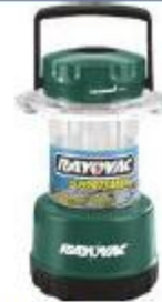
Krypton 4D Area Lantern

Ace $9.99 TrueValue $9.99 Amazon.com $8.97