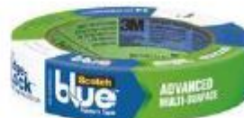
1" Blue EdgeLock Tape