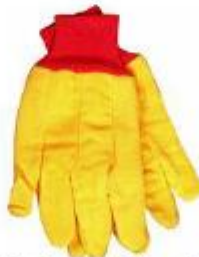
12-Pk Large Yellow Chore