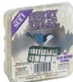
11-oz. Treat Suet (Nutty or Berry) Sku #730679/730693

M&S VALUE PRICE: 20 Foot $139.00 24 Foot $159.00