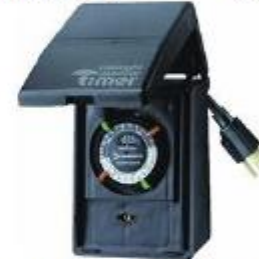
15A Outdoor Plug-In Timer