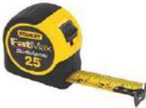
25' FatMax Tape Measure

M&S VALUE PRICE $69.98 Ace $109.98 Lowe's $99.98 Amazon.com $92.33