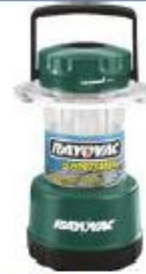
Krypton 4D Area Lantern

Ace $9.99 TrueValue $9.99 Amazon.com $8.97