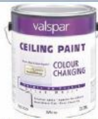
Colour Changing Ceiling Paint