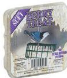
11-oz. Treat Suet (Nutty or Berry) Sku #730679/730693

M&S VALUE PRICE: 20 Foot $139.00 24 Foot $159.00