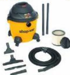
10-Gal. Wet/Dry Vac

The Home Depot $23.49 Ace $21.99 Amazon.com $16.78