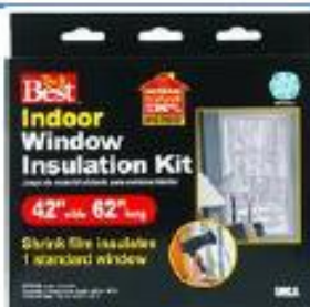
Shrink Window Insulation Kit