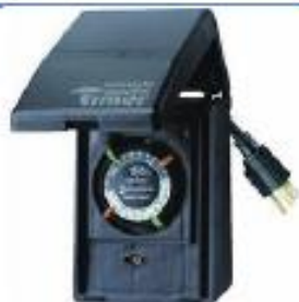
15A Outdoor Plug-In Timer