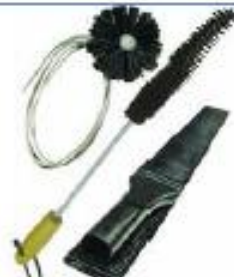
3-Pc Dryer Duct Cleaning Kit