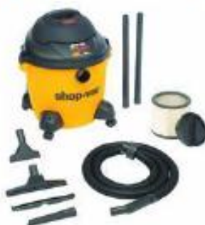
10-Gal. Wet/Dry Vac