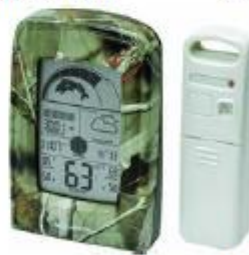
Sportsman Forecaster Weather Station