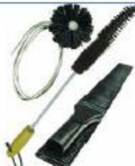
3-Pc Dryer Duct Cleaning Kit