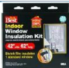
Shrink Window Insulation Kit