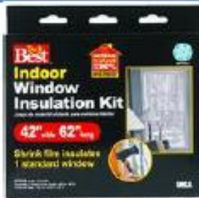
Shrink Window Insulation Kit Sku #283028