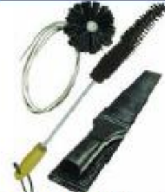
3-Pc Dryer Duct Cleaning Kit Sku #277890