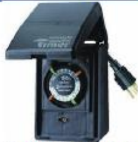
15A Outdoor Plug-In Timer Sku #500805