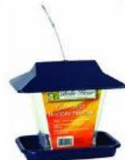
Hopper Feeder Sku #700961