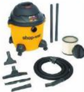
10-Gal. Wet/Dry Vac Sku #379611