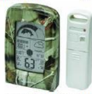
Sportsman Forecaster Weather Station Sku #650189