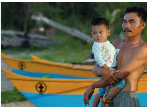
Indonesia

• Through the 11,400 CWS Blankets sent to relief agencies and churches in New York, New Jersey, West Virginia and Pennsylvania for people impacted by Hurricane Sandy. And through CWS disaster-recovery workshops attended by more than 1,200 people in affected communities.