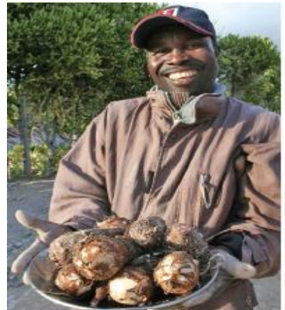
Haiti