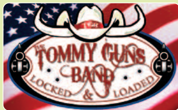
Tommy Guns Band