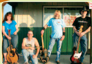
Make Mine Country Band

Look for Even More Free Entertainment Throughout the Fair, All Week!