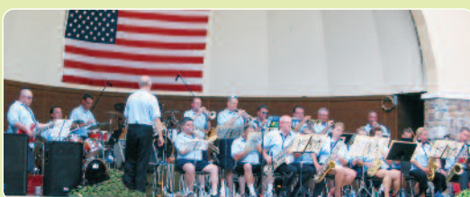
Blue Silk & Satin