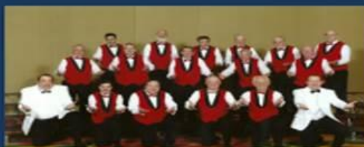
The Ches-Mont Jubilaires Barbershop Chorus