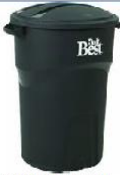
32-Gallon Trash Can sku# 608017