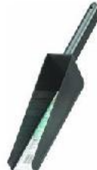
Gutter Scoop sku# 120367