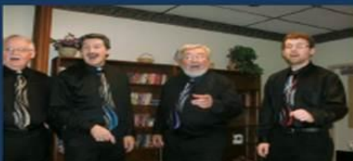
The Ring Leaders