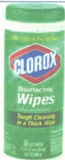
35-ct Disinfecting Wipes sku# 617130