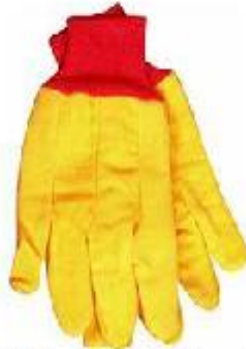
12-Pk. Large Yellow Chore Gloves sku# 705650