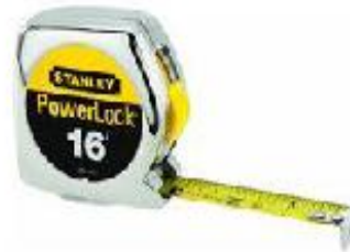
Stanley 16' Powerlock Tape Measure sku# 303665