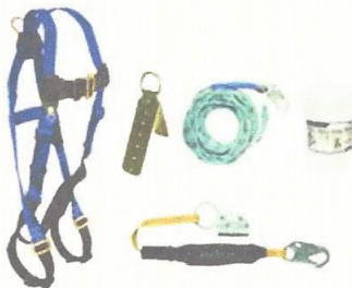
Roofers Fall Protection Kit sku# 347565