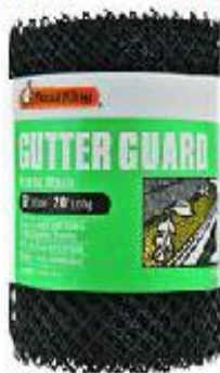
Plastic Gutter Guard sku# 121816