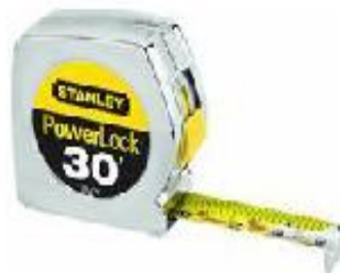
Stanley 30' Powerlock Tape Measure sku 300935#