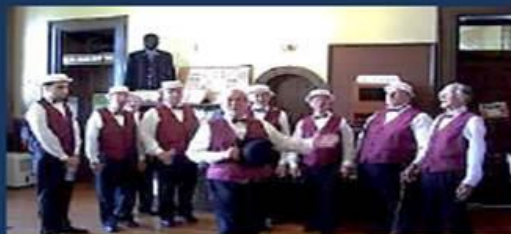
Coalcracker Barbershop Chorus