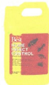
Gallon Home Pest Control sku# 727945