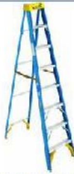
T-1 FBGL 8 FT Step Ladder sku# 791601